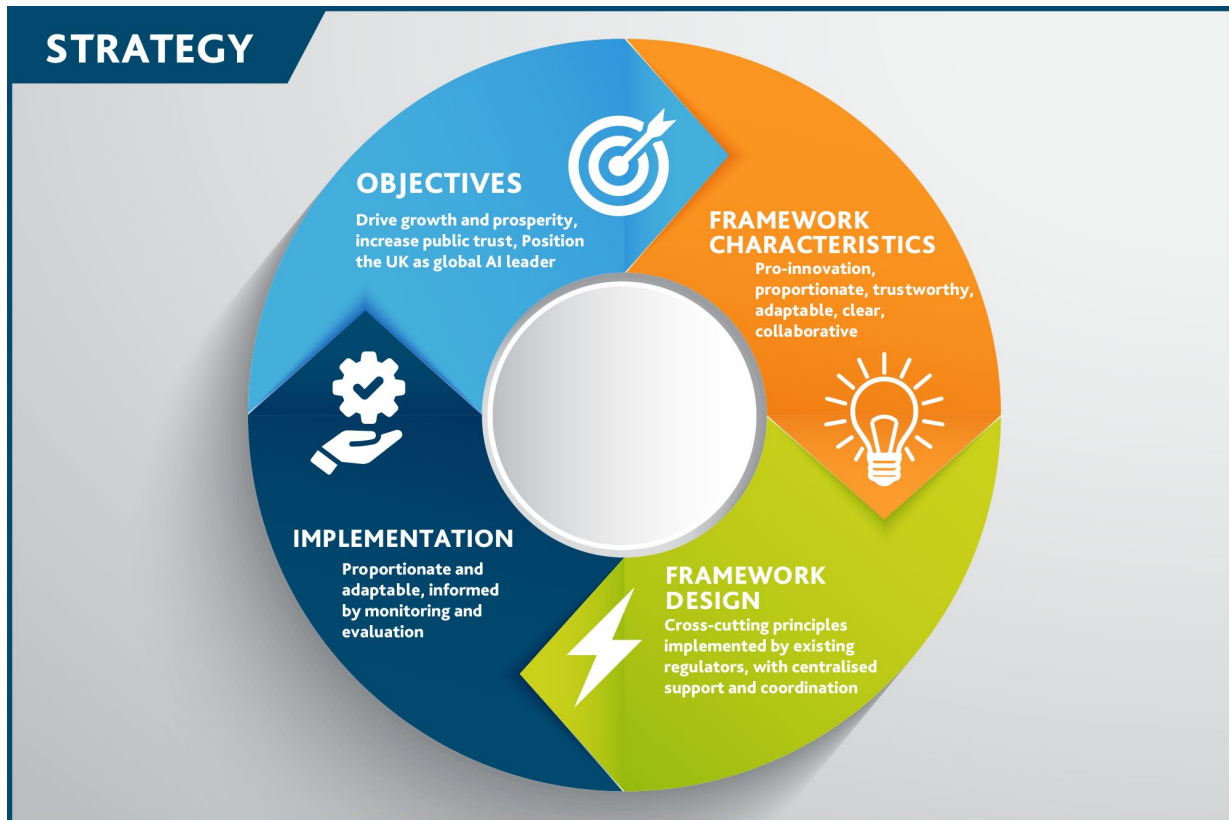
Figure 1: Illustration of our strategy for regulating AI