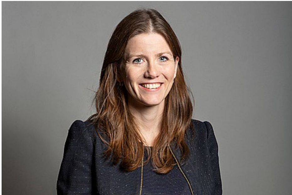
The Rt Hon Michelle Donelan MP, Secretary of State for Science, Innovation and Technology

I believe that a common-sense, outcomes-oriented approach is the best way to get right to the heart of delivering on the priorities of people across the UK. Better public services, high quality jobs and opportunities to learn the skills that will power our future – these are the priorities that will drive our goal to become a science and technology superpower by 2030.